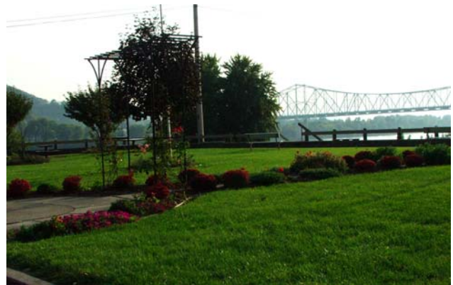
Alexandria Park: The Public/Private Partnership in action

• S elf-help. Only local leadership can initiate long-term success by fostering and demonstrating community involvement and commitment to the revitalization efforts.