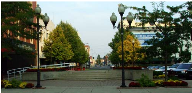
The Esplanade in full bloom. Another MSP success.